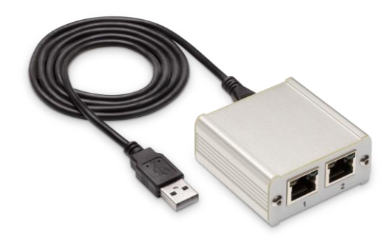
Figure 2: SensorBridge with a usb cable

The hardware specifications of the SensorBridge are the following: